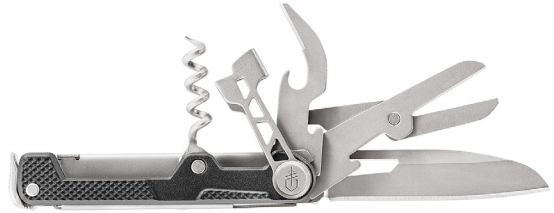
MULTI-TOOL ARMBAR CORK ONYX GERBER