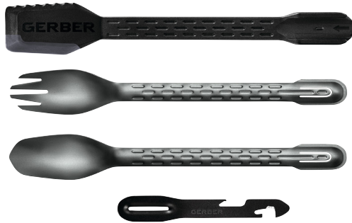
TOOL COMPLEAT ONYX GERBER