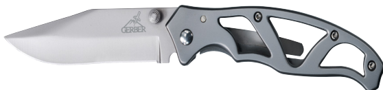
KNIFE PARAFRAME II FINE STAINLESS GERBER-