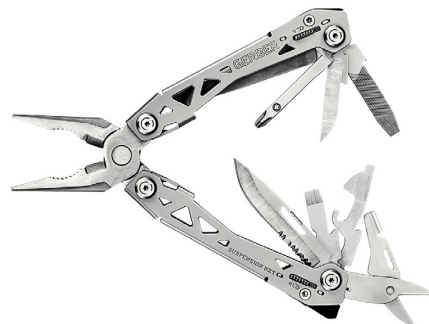
MULTI-TOOL SUSPENSION-NXT SILVER GERBER