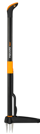
WEED PULLER 4PRONG XACT FISKARS

Ideal for edging, cleaning walkways and driveways and creating landscape edging.