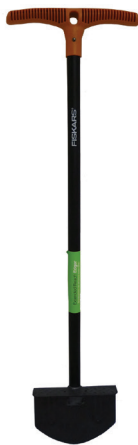
LONG HANDLE EDGER FISKARS

A trade quality shovel ideal for digging post holes and clearing deep, narrow holes and pits. Ergonomically designed with a long lightweight handle for extra leverage.